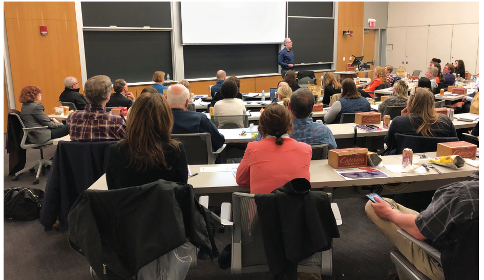
Sixty community members participated in the “Responding to Students in Distress” workshop.